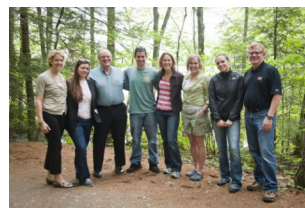
Newman's Own Foundation visits Camp Woodstock

During the week of May 23rd, The Discovery Center celebrated its first annual "Newman's Own Foundation Week" in honor of our friends at NOF. Six NOF staff visited The Discovery Center program at Camp Woodstock. Visitors toured the facilities; observed diversity, academic, and team building classes, and enjoyed lunch with students from Hebron Avenue Elementary and East Hartford Glastonbury Elementary Magnet School. A special "thanks" to NOF for their continued support of The Discovery Center program.